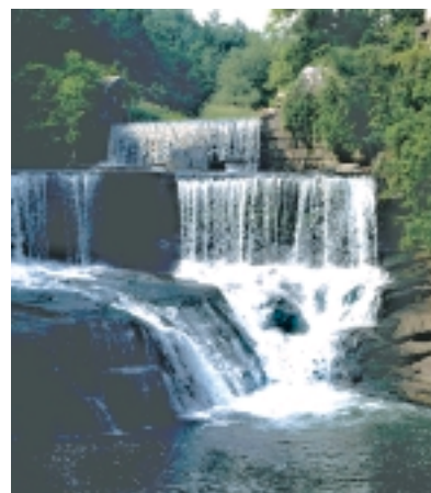
Keuka Outlet Trail