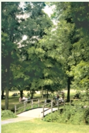
Keuka Lake State Park

Tuttle Road (south of Italy Hill), Italy